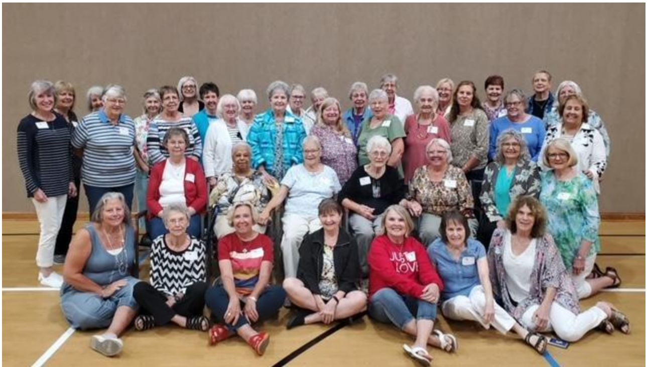
Women of the Osage Cluster Gathered at St. Paul's Lutheran, Cole Camp, on June 1 st , 2024