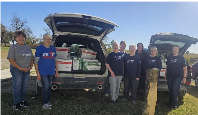
Got them loaded—now on to the ingathering site (L) Walsburg Lutheran, Leonardville, KS (below) Messiah Lutheran, Springfield, MO