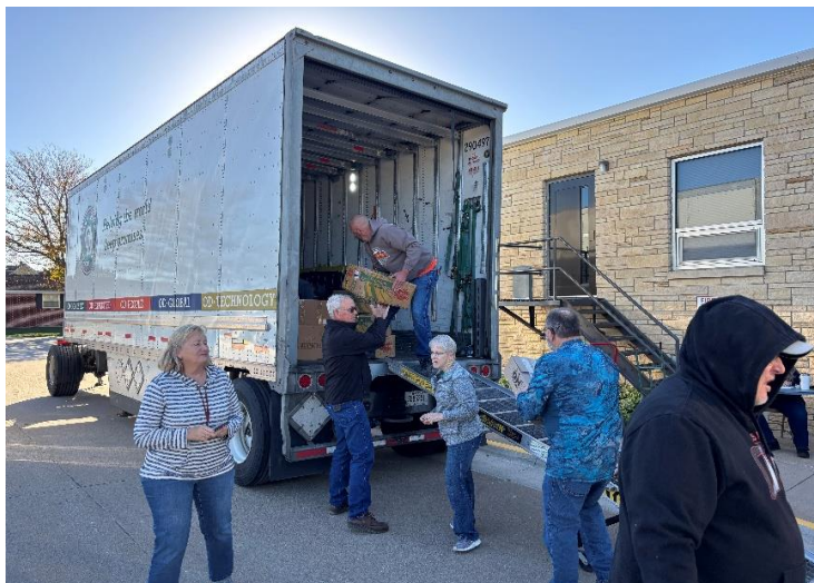
Ingathering Site (L) Trinity Lutheran, Hays, KS