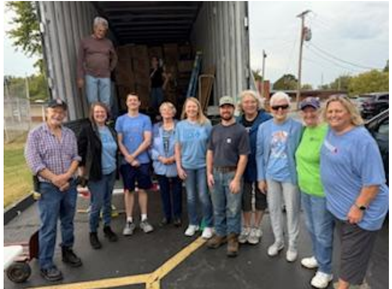
Ingathering Site Lutheran Church of the Good Shepherd, Hazelwood, MO