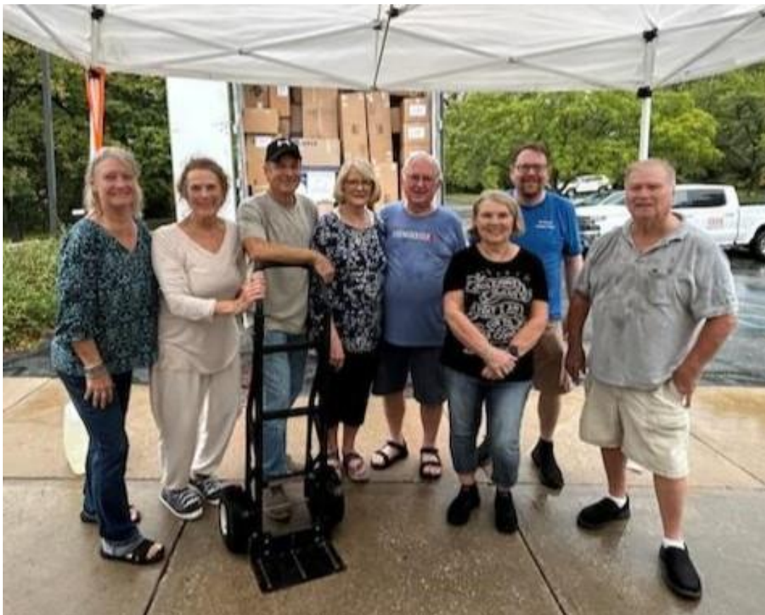
Ingathering Site Our Savior's Lutheran, Jefferson City, MO