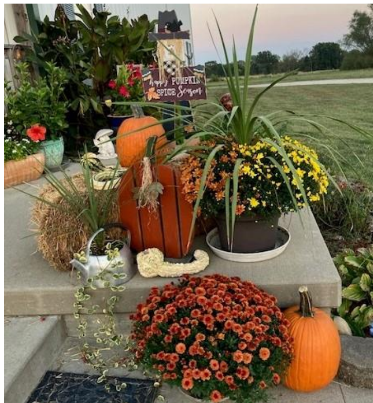
Autumn on the Benton County Prairie

However, one of the lepers, realizing he was made clean, turned back and praised God. Seeing Jesus, he fell down before him and thanked him. This man was a Samaritan, who belonged to a society of people highly despised by the Jews, an outsider. It was this Samaritan, this foreigner, who returns and gives thanks. Jesus then commends him both for his faith and his thankfulness. This Samaritan was not only made clean, but his faith made him whole and he was given an even greater gift—salvation. He was healed, saved, and made whole!