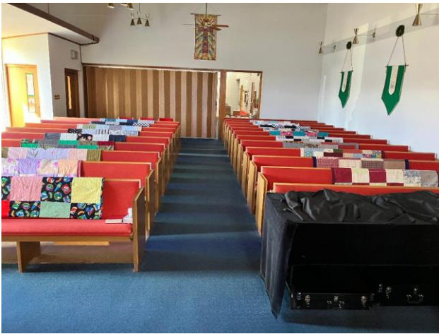
Awaiting their blessing (L) St. John Lutheran, Pittsburg, KS (below) Our Savior's Lutheran, Topeka,