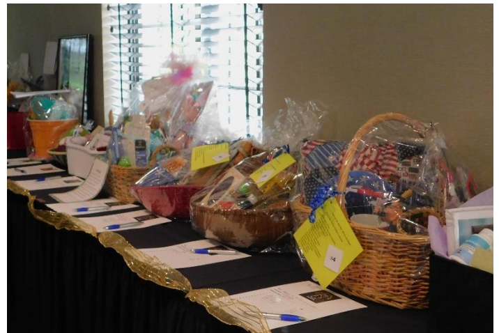
Items Donated to the Silent Auction Never Disappoint $1,045 Raised for the Barbara Nelson Memorial Scholarship Fund