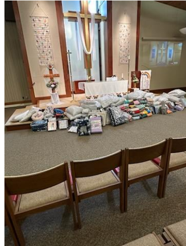
Border Cluster ingathering for Sleep in Heavenly Peace

Not just any group of women, but the Women of the ELCA. We march if we feel we must, we speak