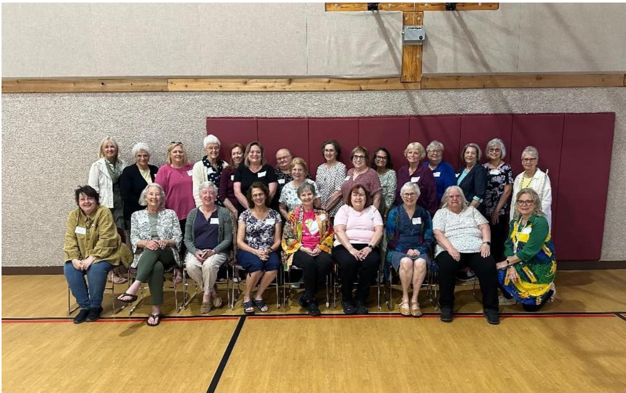
Eastern Cluster Ladies