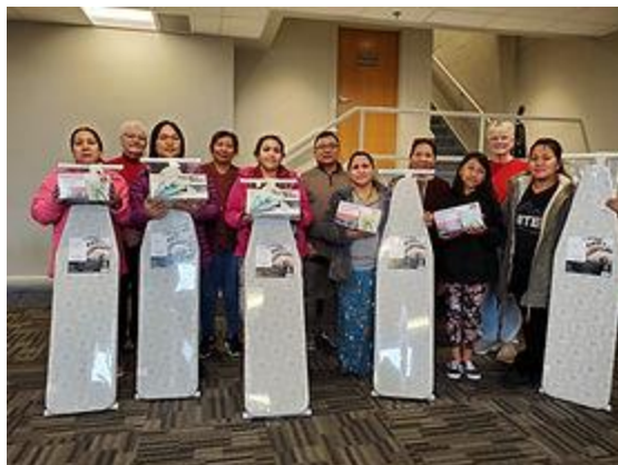
Photo of recent OWWR sewing course graduates

In addition to sewing, OWWR provides computer skills training, job search tactics, and helps with home business start-ups. OWWR has assisted students in launching careers in nursing and medical language interpretation among others.