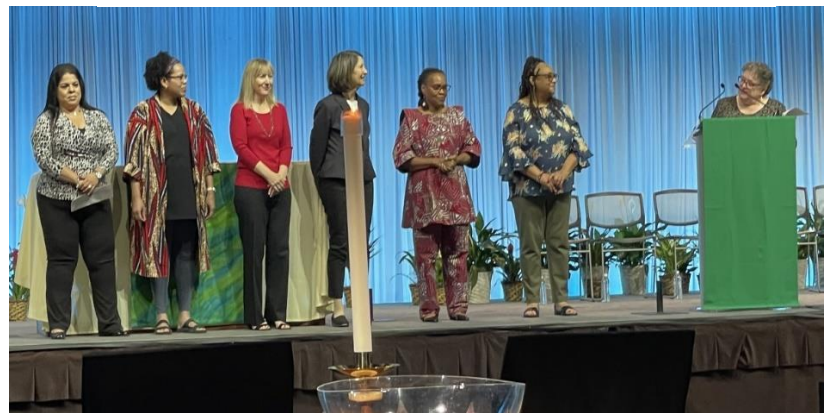
Women of the ELCA Churchwide Staff