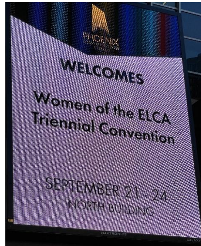
Enjoy This! We were patient in our effort to capture our electronic welcome

Mark Your Calendars Now You Won't Want to Miss This 13 th Triennial Gathering July 16-19, 2026 Des Moines, Iowa